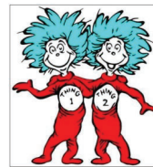
Week of Mar. 1

Pick up a craft in the Youth Department for the kids to create at home. Post a photo of your child's completed craft on the library's Facebook page or email the photo to plong@nweb.lib.in.us to get entered in the weekly drawing for a free book.