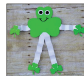
Week of Mar. 8