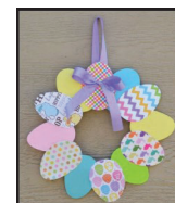
Week of Mar. 29

In case of bad weather, library closings will be announced on WSBT-TV, WNDU-TV, WRSW-FM, Inkfreenews.com, Newsnowwar-saw.com, and Facebook. Email subscribers will receive email notification.