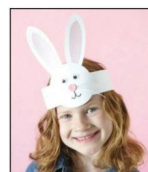
Week of Mar. 22