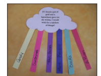
Week of Mar. 15